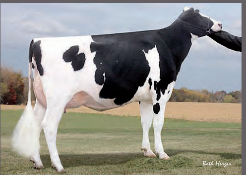
Sandy-Valley Go Firelite VG-88 2yr The Goldwyn dtr of Ralma Durham Fireball EX-92, that Shema Holsteins sold for $110,000 at a Top-10 Sale.