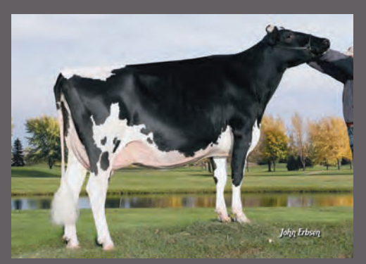
Ralma Christmas Cookie VG-89 1st Lac One of O-Mans most popular daughters, she is due to calve again in June this year