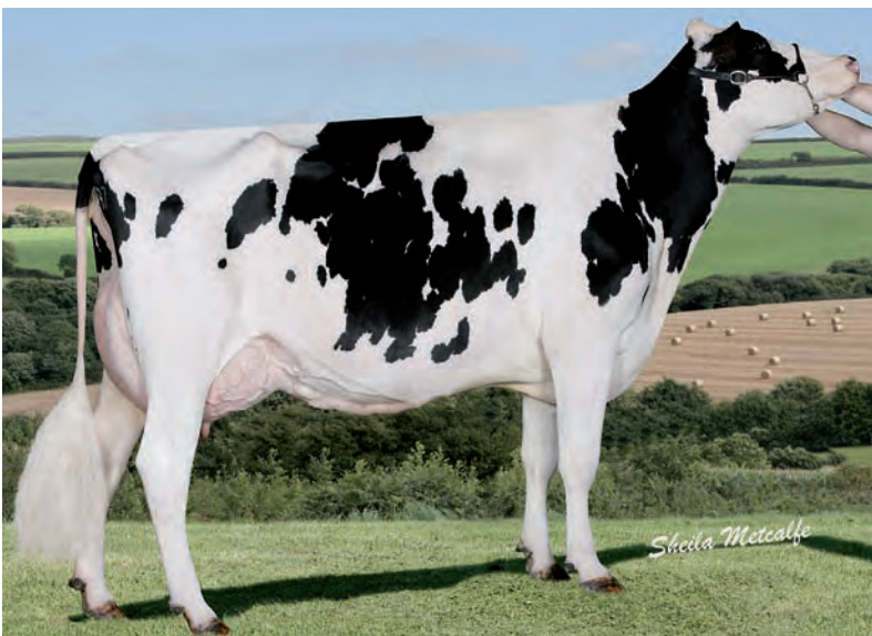
Ridgefield Shottle Ghost VG-89 3yr Currently one of the family's biggest stars- owned by Willsbro Holsteins