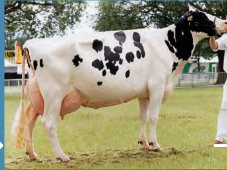
Lemington Skychief Ghost EX-95 3E