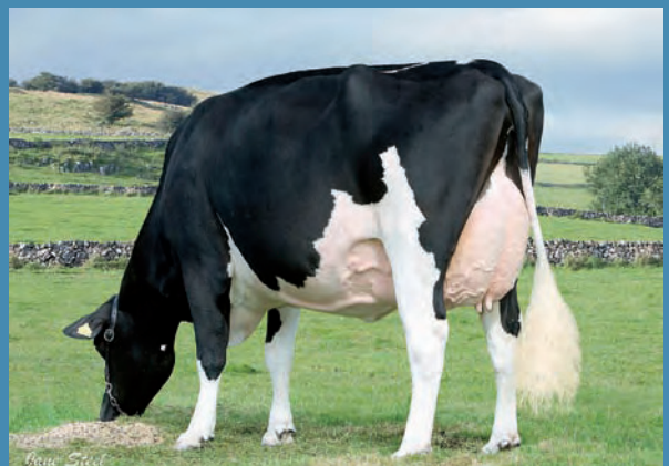
Sterndale CB Allen Ghost EX-92