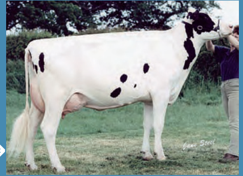
Castlerhydd Milan Ghost EX-94 4E

and the Royal Welsh, her mammary system was picture perfect, she had a tremendous rear udder with superb veination throughout—something which all the Ghost family have notably inherited. Every lactation she won shows, and she went on to win classes at the Royal show in 2000 and 2002, classifying EX-95 3E. Her Counselor dam perhaps wasn't the greatest milker, and Skychief's were not renowned for massive yields either, but Skychief Ghost was a great producer and twice gave over 15,000kgs in 305 day lactations!