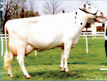
Witbourne Counselor Ghost EX-92