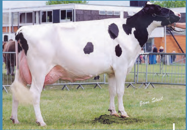
Ridgefield Storm Ghost EX-93 2E 2X All Britain in milking form

From a personal note, and having worked with many of them, I have never seen a family that consistently delivers this level of type. Now with the introduction of genomics the family is seeing more interest from International AIs and in the future we can fully expect to see the Ghost influence continue to grow as bulls from this family enter AI.