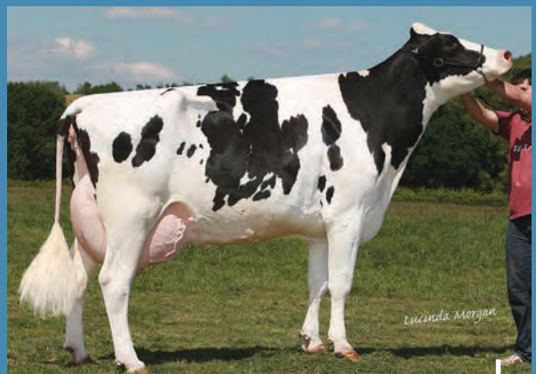
Riverdane Terrason Ghost EX-94 2E Sold for 27,000gns (EUR 34,000) as a bred heifer