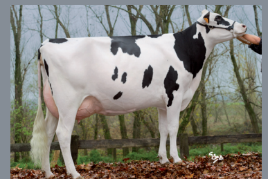
All.Nure Baxter Roxy VG-85-IT 2yr.