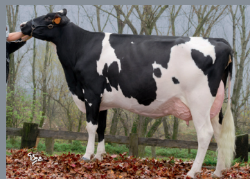
All.Nure Serenella VG-87-IT 2yr.

US 04/11 GTPI +2198 #2 (VG) GTPI Baxter in the Breed