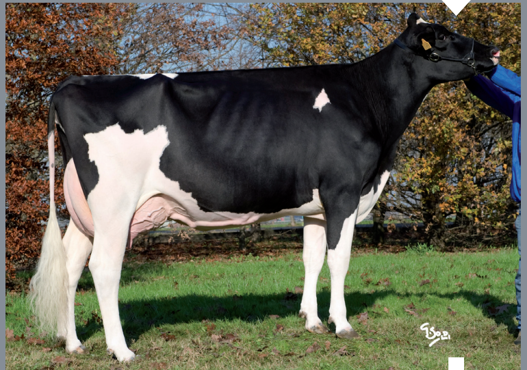
La Felce Seretta VG-88-IT

Fantastic Goldwyn dtr and great brood cow Baxter was a truly "Golden Cross" on her!!