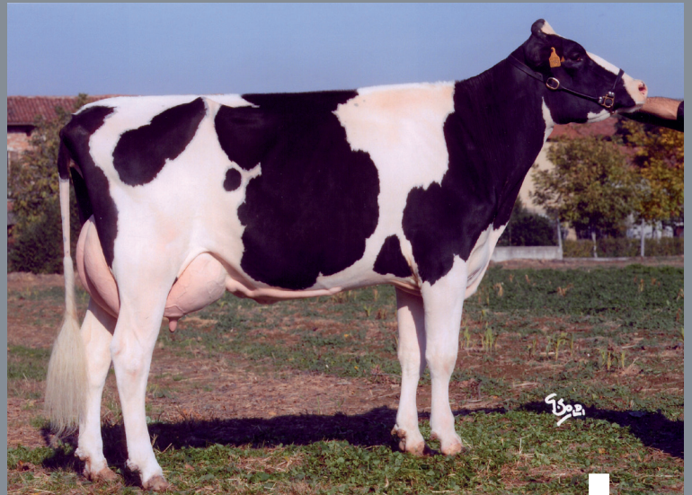
Aurora Nesta EX-91-IT

Durham grand dtr of Judy! Great offspring including Excellent Cows & show winning dtrs