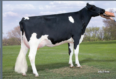
Morningview G Addition VG-87-USA 2yr. Great new generations of Judy's

Converse Judy did an amazing job as brood cow with plenty of good daughters, her grandson Morningview Ashlar at Semex has been used around the world as a sire of sons and the newest generation of sky-high genomic young sires are getting global popularity.