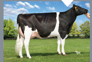
All.Nure Baxter Silky VG-85-IT 2yr.

US 04/11 GTPI +2215 #1 GTPI Baxter in the Breed