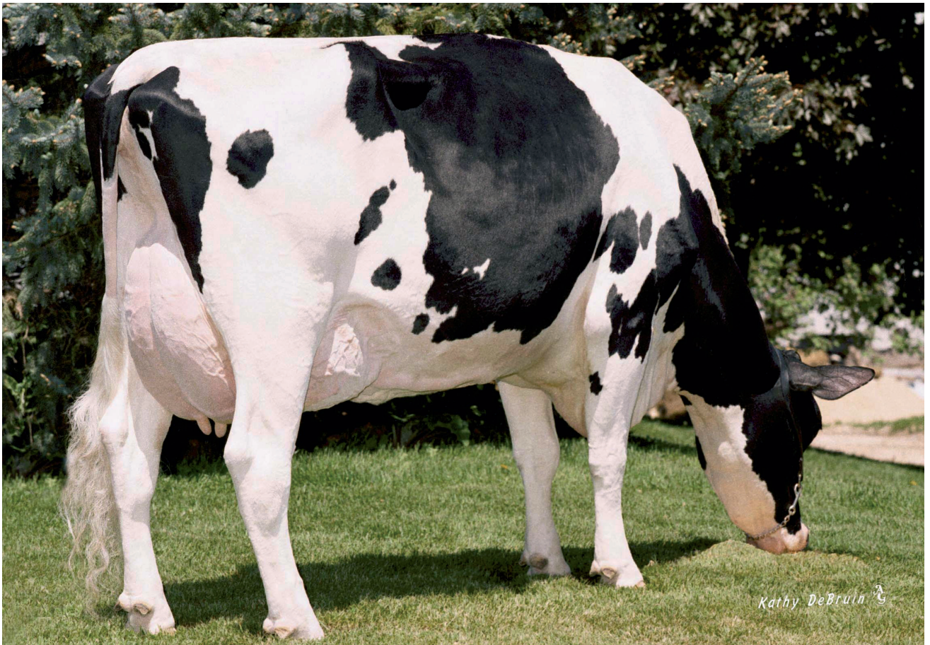
Morningview Converse Judy EX-93-USA GMD DOM