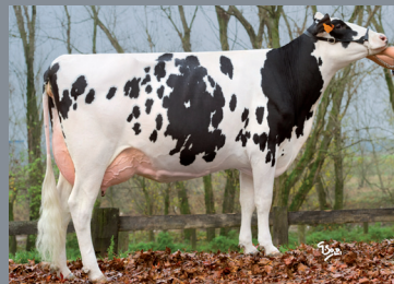
All.Nure Baxter Silky VG-85-IT 2yr.

US 04/11 GTPI +2215 #1 GTPI Baxter in the Breed