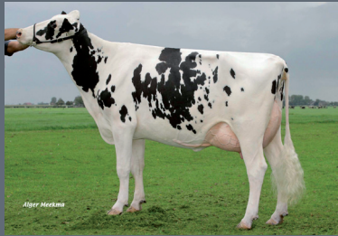
Heidenskipster Shottle Silver VG-87-NL 2yr. Amongst the very best GTPI Transmitting cows in the breed!!