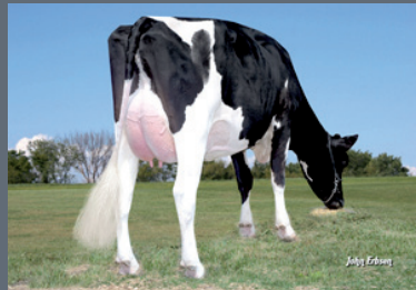
Morningview Tstory Amaya VG-88-USA 2yr. One of the greatest Toystory's in the breed! Sold for $ 75,000 to De-Su Holsteins