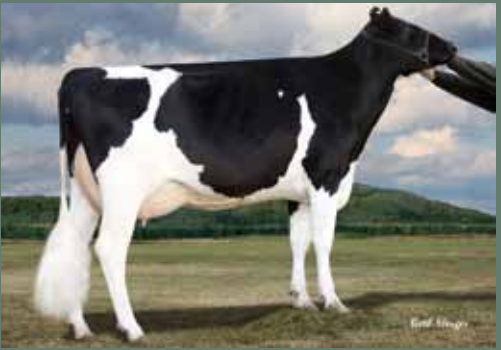
KHW Goldwyn Aiko-ET *RC VG-86 Heavily contracted *RC Goldwyn daughter of Altitude!