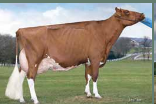
KHW Regiment Apple-Red-ET EX-94 DOM "Million Dollar Red Cow" and All-American!