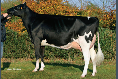
Carf Emeraude VG-89-NL 2yr. National Jr. 2-Yr. Old Champion & +18 g Conf.!