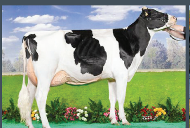
Danoise VG-87-FR 2yr. Dam to Cabon Fernand @ Semex